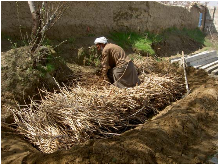
“Jauge” for keeping the scions away from desiccation before grafting