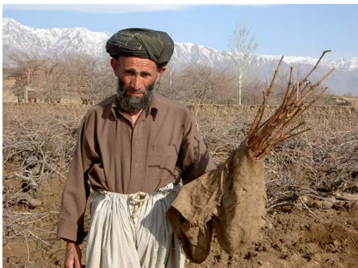
Scions wrapped in cotton sheet