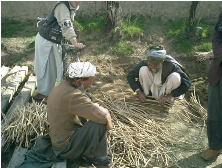
Prepare the scion only from very fresh pruned vines – and keep them wrapped in cotton sheet or in “jaug”